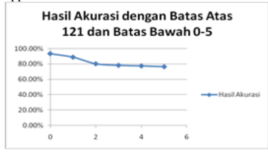
Figure 3. Upper Limit Accuracy Results 121

a. Upper Limit = 121 with Lower Limit = 0-5