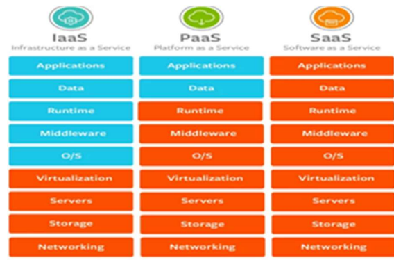
Figure 3 IaaS, PaaS and SaaS

The use of cloud computing for One Data Indonesia can provide benefits, namely being able to store data in the cloud where security is more guaranteed at an affordable cost, data on cloud computing can be used as integrated data, large-scale data analysis can be carried out, and cloud computing can facilitate easy collaboration between various government agencies.