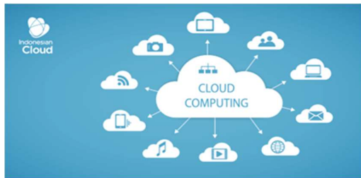
Figure 2 Cloud computing

Cloud Computing is a computing model where by using internet facilities users can access data, store data, and use cloud services from different geographical areas. Cloud computing is data processing where resources such as software, databases, data storage media, server computers, and internet networks can be used together according to the needs of the user flexibly and payments are adjusted to what is used by the user. Cloud service providers will share the use of resources so that they can be used by many users simultaneously [10]. The basic principle of cloud computing is that users can easily access computing resources (On-Demand Access), such as hardware and software resources, flexibility in the use of computing resources, cheaper costs, and where users only pay according to what they use [11]. In addition, it also provides good data security services, such as data encryption, and users can access resources on cloud computing from different places worldwide. In providing its services, cloud computing has three main service models [12].